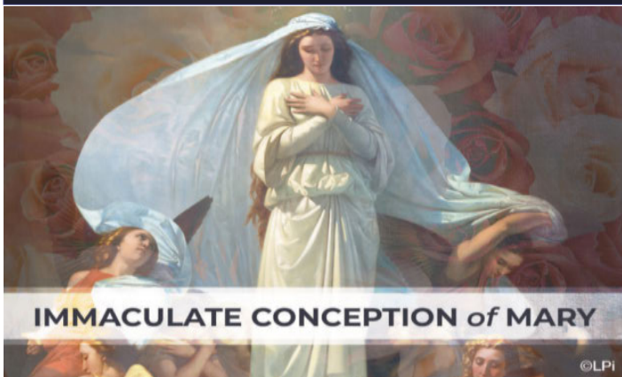
IMMACULATE CONCEPTION of MARY